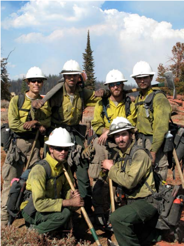
Charlie Squad, Cascade Complex Idaho.

The 2007 season was busy and long. The following chart shows an at a glance comparison of the 2006 and 2007 seasons. Note that in 2007 the UFRA crew stayed intact and available much longer than historically, this was due to student interest in extending past the August 13 th semester. This enabled UFRA to travel to Southern California for fires in late October.